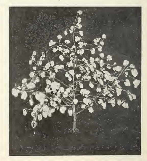
STALK OF COVINGTON-TOOLE COTTON

I trust this is the information you desire.